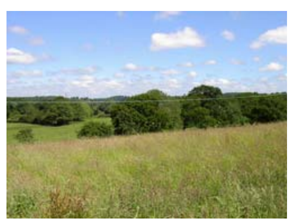
The closest trees mark the course of the West going stream close to World's End. There are remnants of water meadows above and below this point.

times there were three areas in which water-meadows were a valuable commodity to the farmers. Two of these were in the vicinity of World's End and one approximately in the Anmore area. Traces of the sluices connected with these meadows are still visible.