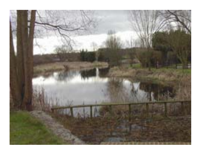
Willow Lake, World's End

due to a combination of spring lines (not all of which are in the lowest parts of the parish) and the high water table.