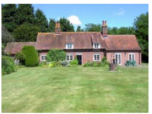
This tastefully renovated and extended building is in World's End