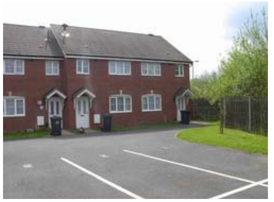
Affordable housing can fit in with other houses and look attractive.

8.13 Surface water flooding happens every time there is heavy rain for more than one hour or prolonged medium rain. The storm water drains are either inadequate or poorly maintained by the appropriate authority or both. In some cases the storm drains are inadequate, but all flooding should be reported to the Parish Council who will pass the information on to the Highway Authority via the Local Area Office. The regular flood at the junction of Kidmore Lane and Hambledon Road, which is on a minor crest, is an example of damaged drains. The flooding in Southwick Road (C40) close to the entrance to the recreation ground is due to over-laden drains. The flood takes up to an hour to clear after rain ceases. Flooding is also a regular feature on Fareham Road - often but not always due to the drains from the road to the ditches not being kept clear. All the surface water flooding creates a hazard to all road users.